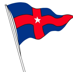
New York Yacht Club